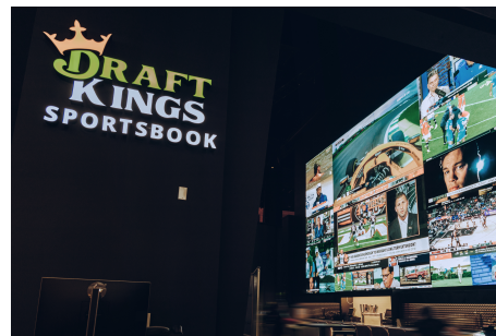
DraftKings Sportsbook at Foxwoods Resort Casino